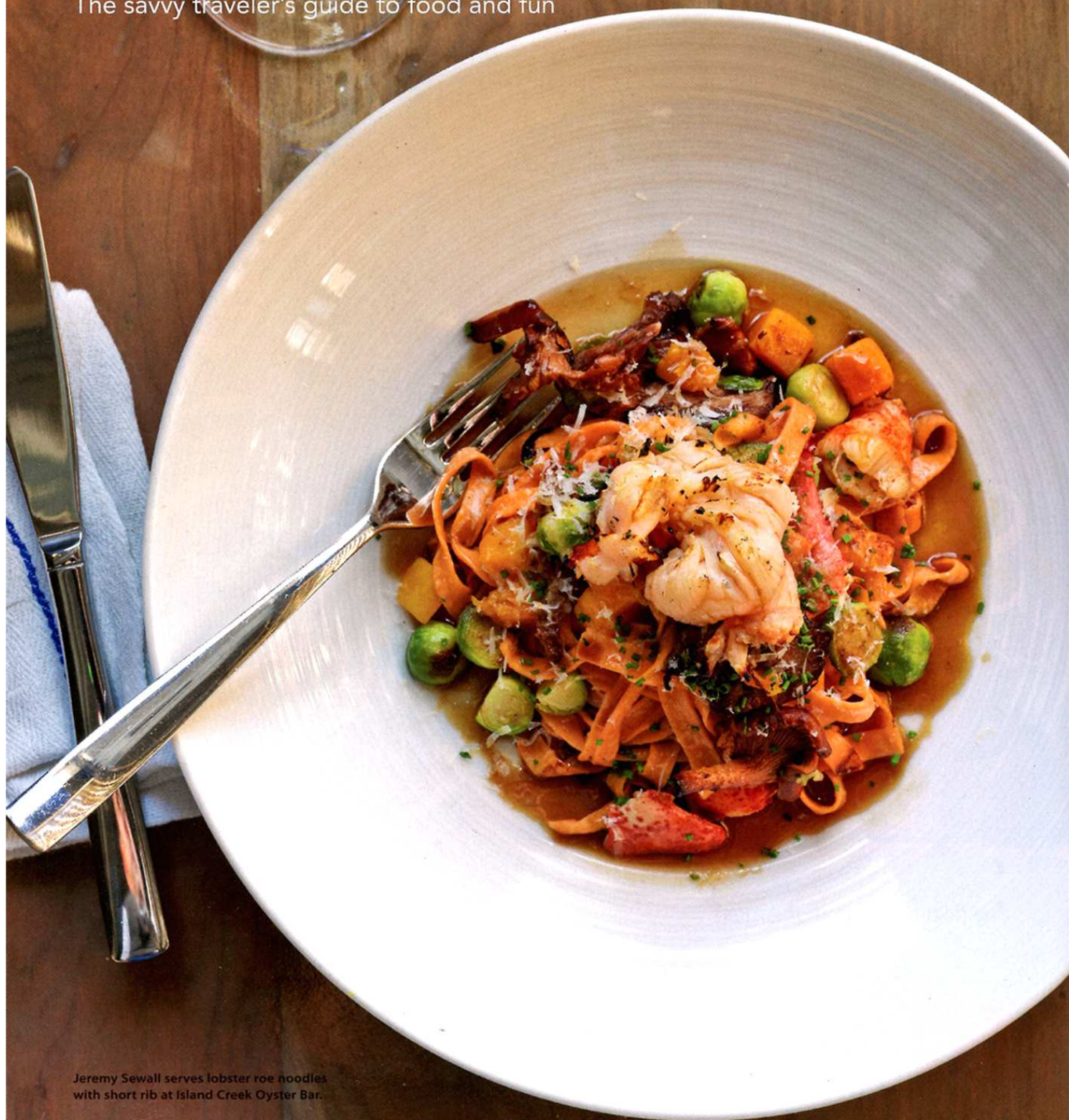
Jeremy Sewall serves lobster roe noodles with short rib at Island Creek Oyster Bar.

The savvy traveler's guide to food and fun