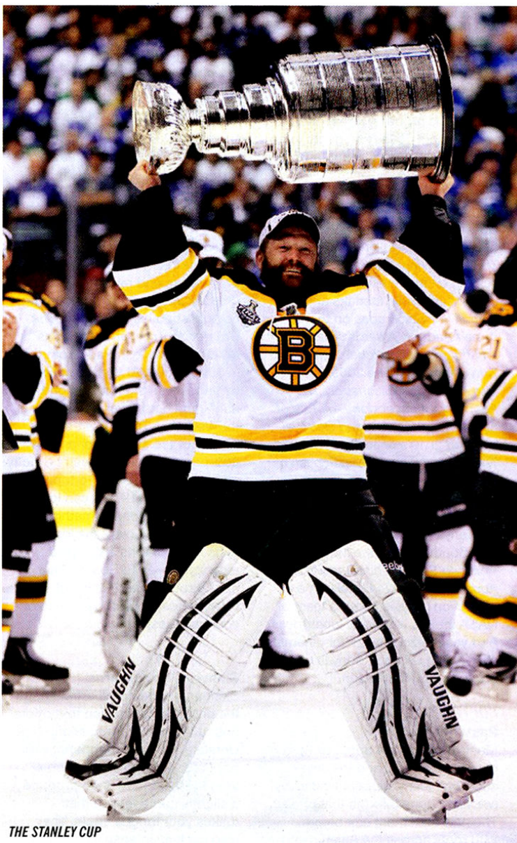
THE STANLEY CUP