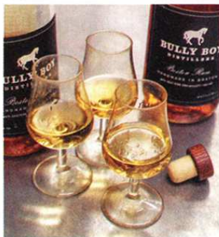
Bully Boy's Boston rum

Growing up in Massachusetts, brothers Will and Dave Willis loved turning apples from their family's fourth-generation farm into fresh cider. As they got older, it was an easy leap to apple brandy, then rum and whiskey. In 2010, they traded their two-gallon stovetop still for the 150-gallon variety. Under the name Bully Boy, an homage to their great-grandfather's beloved horse, the duo produces premium spirits