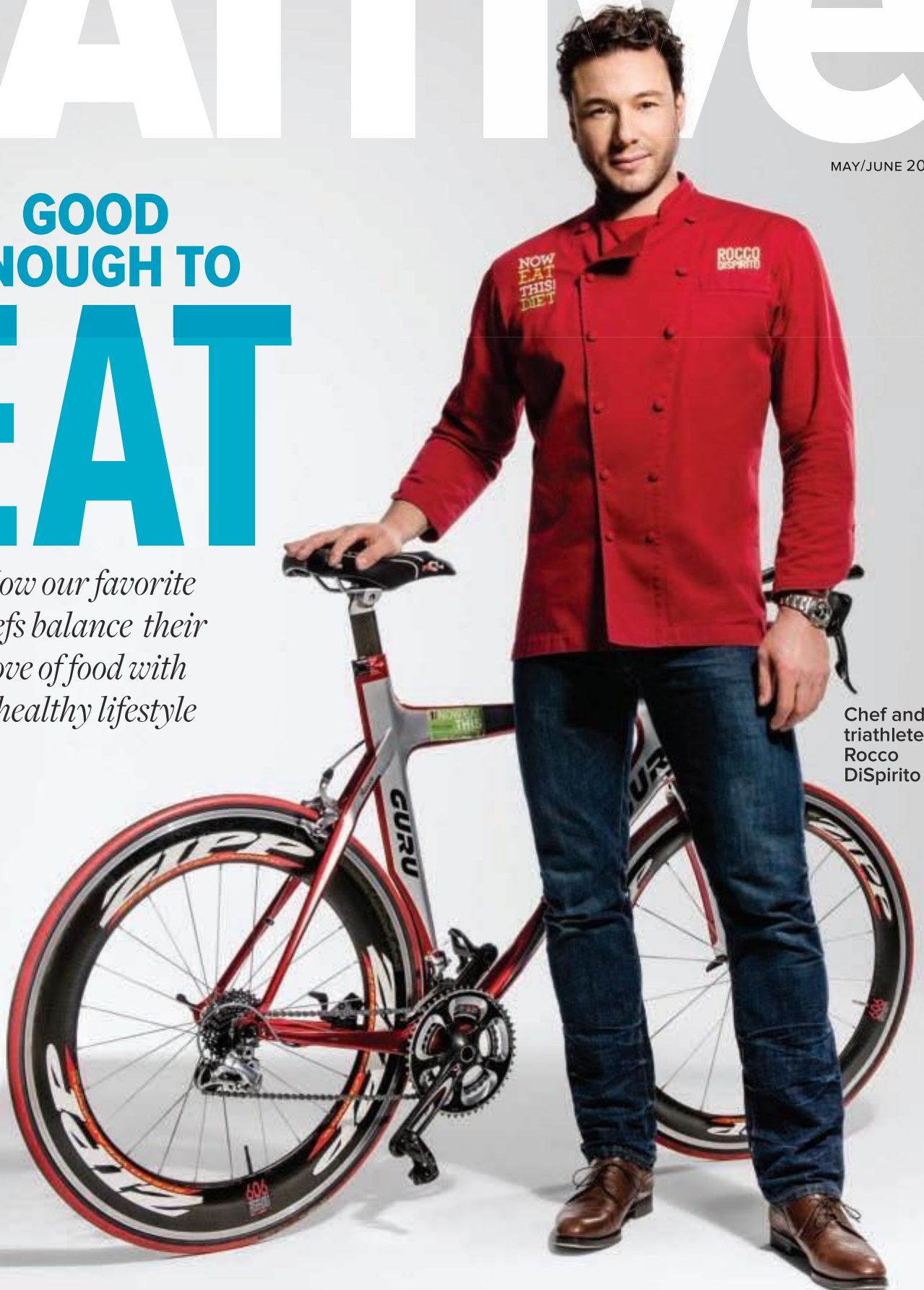
Chef and triathlete Rocco DiSpirito

How our favorite chefs balance their love of food with a healthy lifestyle